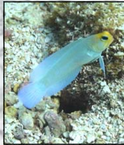
One of Glenn's favorite tropical fish, a Yellow Headed Pearlie Jaw