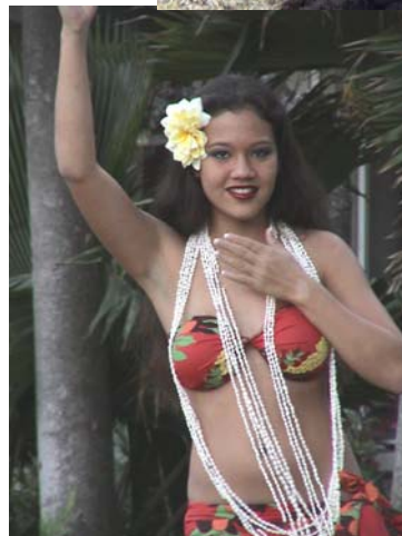
(left) The Luau in Kauai was very interesting with many Hawaiian beauties.