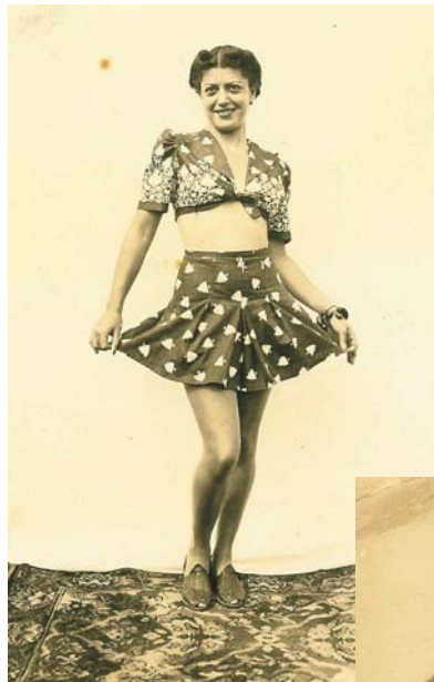
Belle lead a full life!!

http://www.idi.bz/personalbum/belle's_life.htm