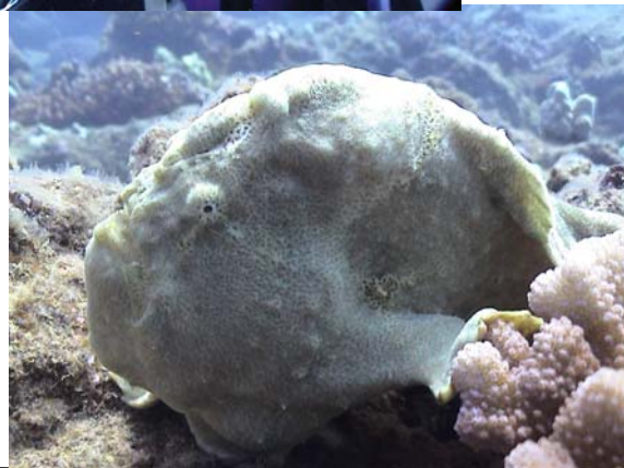
(above) The Frog Fish was one of the most interesting fish we saw while SCUBA Diving in Hawaii.