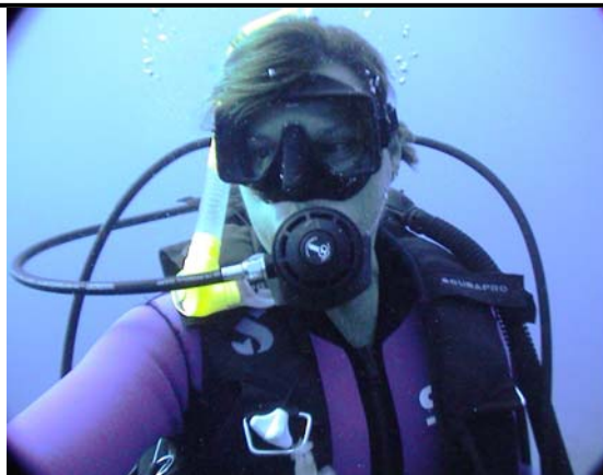
We did a lot of SCUBA diving on this trip to Hawaii