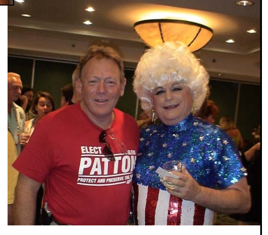
Campaigning in Key West was Fun!!