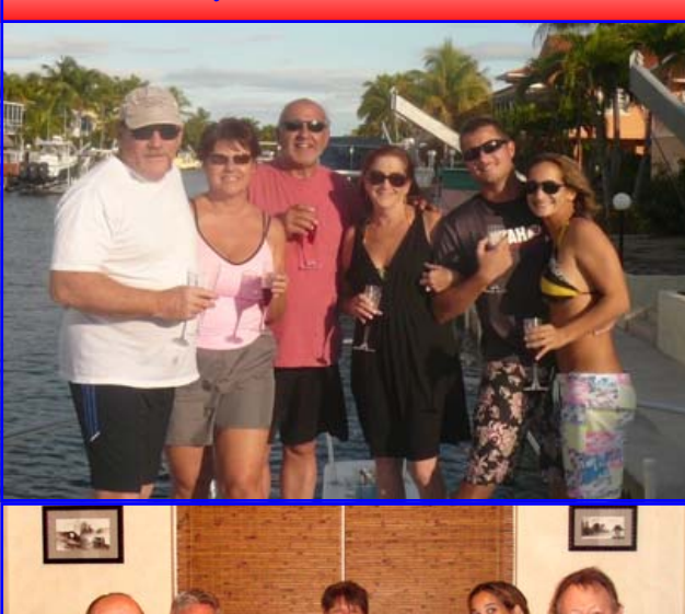
Nov 30th, Thanksgiving redux was pigging out on more Stone Crab claws then we could eat!!