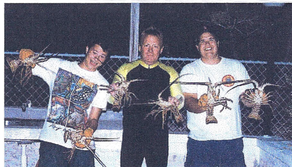
We caught plenty of Lobster in August !

Dumber" five times. In the process they got up early and went to bed exhausted. They have made reservations for the summer of '97.