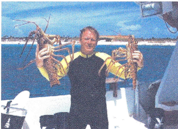
The Fish were a little bigger at Cay Sal

From July 5 to 15, myself and 5 friends went to the Bahama's for a diving and fishing adventure. This adventure took us to the Bimini chain of Islands where we caught Dolphin, Lobster, Stone Crab and all kind of other fish. We also did a tank dive off of South Riding Rock in 65 ft of water where we encounter our first sharks of the trip. On the fourth day, we started to worry about Hurricane Bertha. The Storm was coming pretty close. So we headed back to Miami on the morning of the fifth day. We got halfway back to Miami and the 11am advisory posted a Hurricane Watch north of Dade County. Plus, Bertha was expected to turn more to the north that day. We called everyone that was concerned about our safety to let them know we were OK. So, we turn the ESO 90 degrees to the South which put us on a course directly