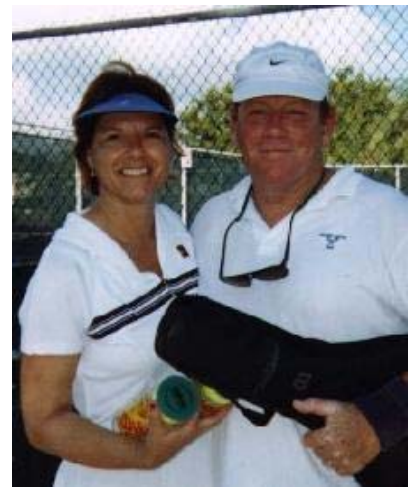
Wow! What a summer, we were busy !!

It was not easy but we managed to get in a lot of tennis this year. In November we were in the finals of the Ocean Reef Club (flight 3) Mixed Double Tournament